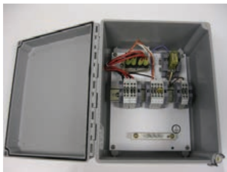
Dump Pump Contractor Panel