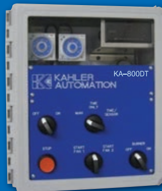
◀ Grain Dryer Controls