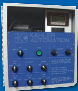
◀ Grain Dryer Controls